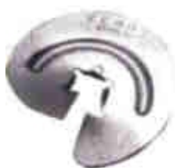
120 mm diam. disk of very high resistance steel

Manufactured from high tensile steel, the anchoring disk is protected by hot-dip galvanising with a very rich zinc content. The disk is reinforced by ribbing to increase its resistance to flexing and prevent it becoming distorted when being installed.